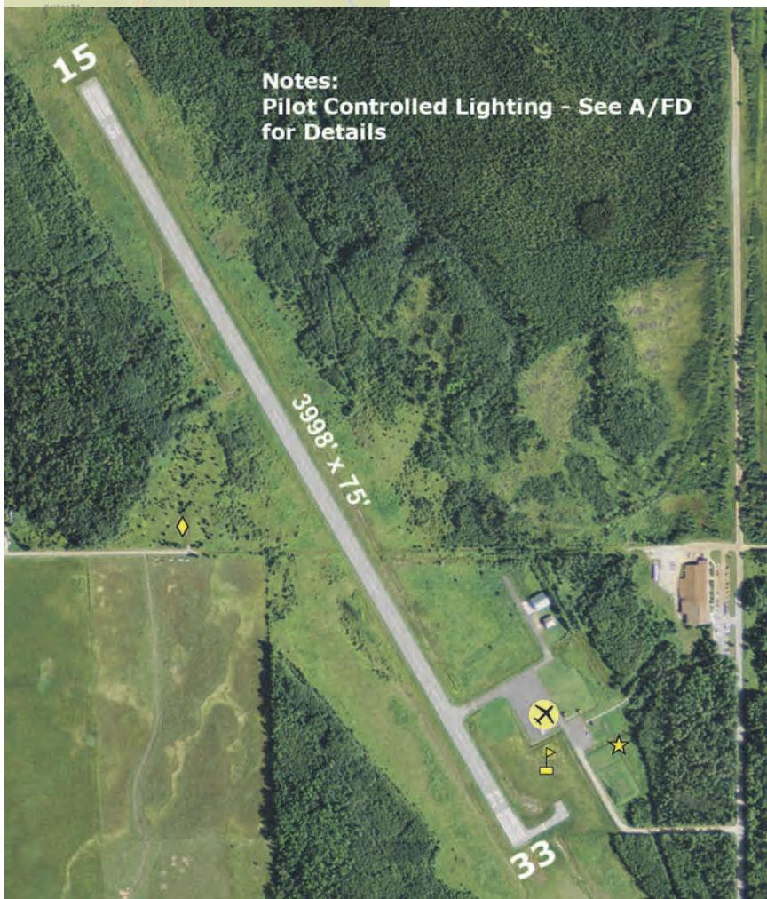
Bigfork Municipal Airport